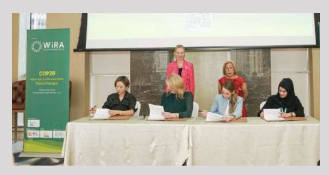
Signing of the Memorandum of Understanding between GWNET, the Women in Renewables Alliance (WiRA) and Diversity Champions, in which the three organisations pledged to work together to advance diversity and inclusion in the energy industry.

Much food for thought and inspiration for GWNET's day-to-day work to support women active in sustainable energy!