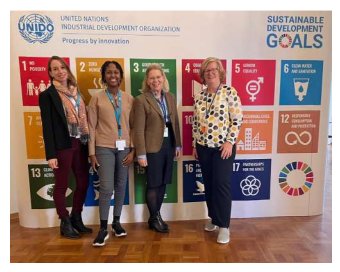
The GWNET Team at the International Vienna Energy and Climate Forum, November 2023

50+ advocacy events, interviews, webinars, podcasts, workshops