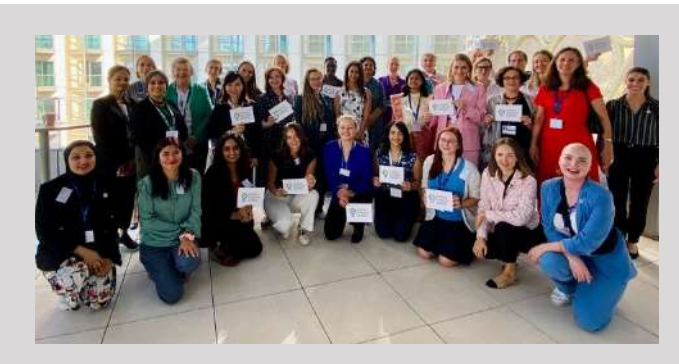
GWNET and Women Energize Women coorganised a networking event themed 'Government & Business United for a Gender-Equal Energy Transition'.